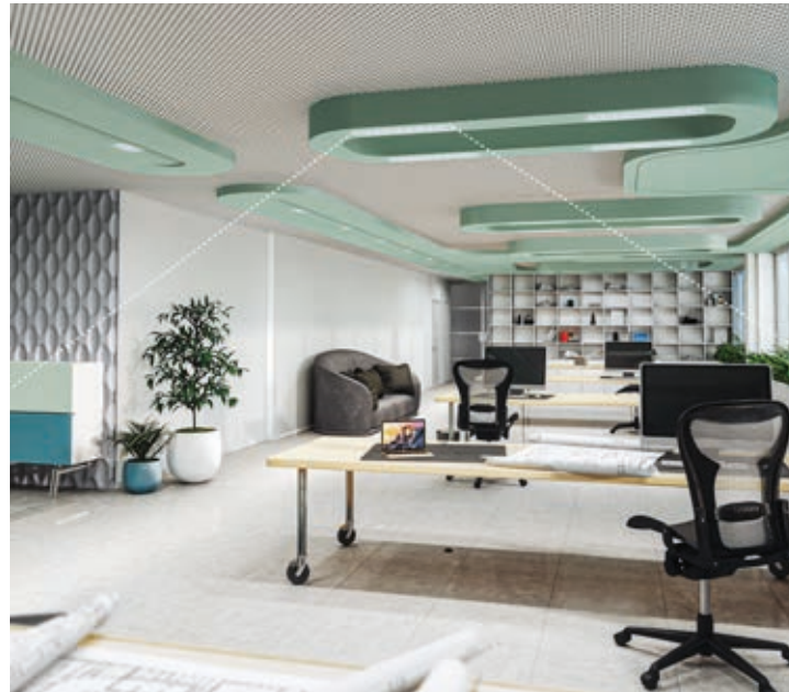
Version ensuring excellent efficiency and visual comfort, with UGR<19.

Dali-Bluetooth interface to program and manage light in a smart manner, simply using the Smart Light Control App that can be downloaded to any device. Lastly, thanks to the built-in beacons, it is possible to send digital information, such as push notifications, or enable indoor navigation, directly on smartphones, as well as collect data for space management. All these solutions are available with two finishes to ensure maximum visual and aesthetic integration.