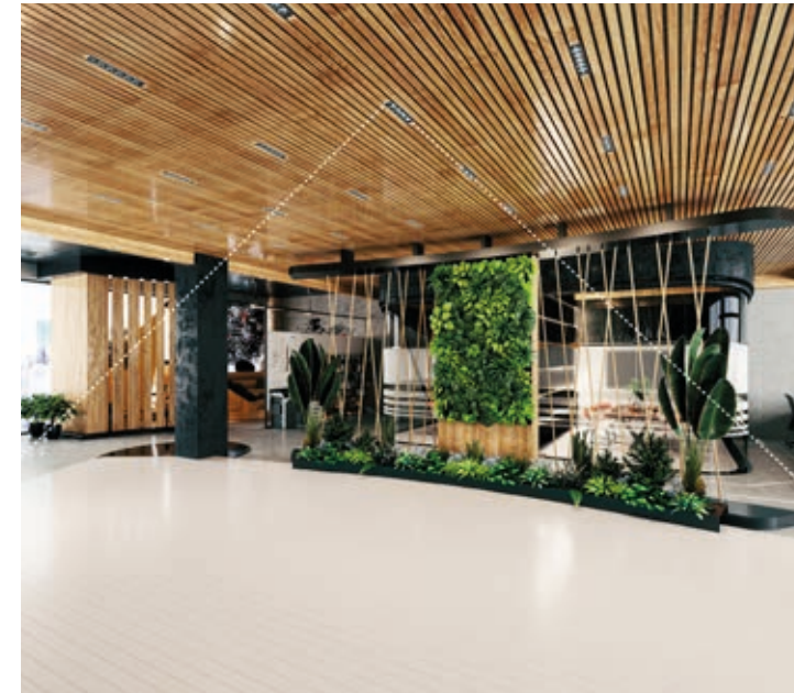
The general lighting version for uniform lighting of spaces.