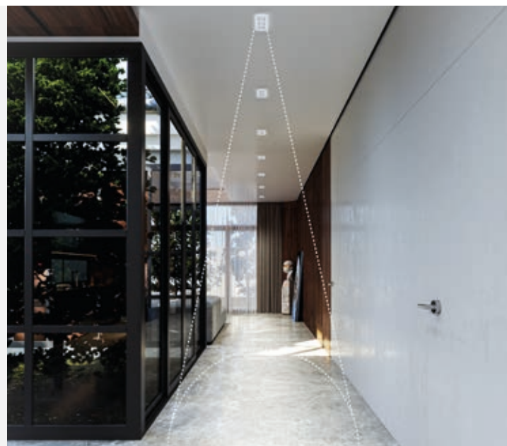
The Wall Washer version to direct light predominantly in the vertical plane.