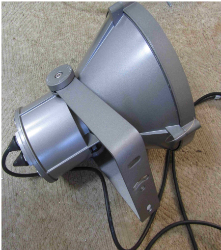
Illustration 4: Luminaire