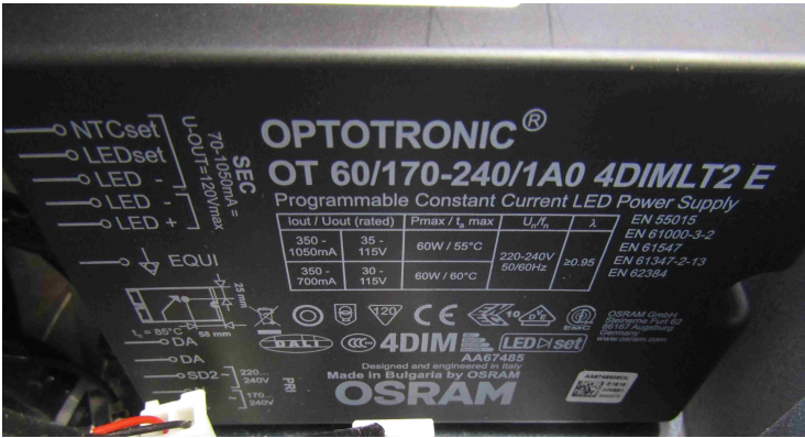
Illustration 3: LED driver