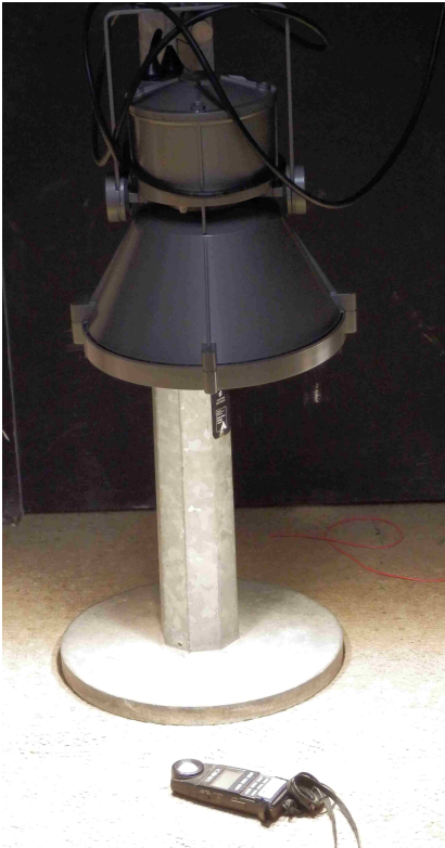
Illustration 5: Setup